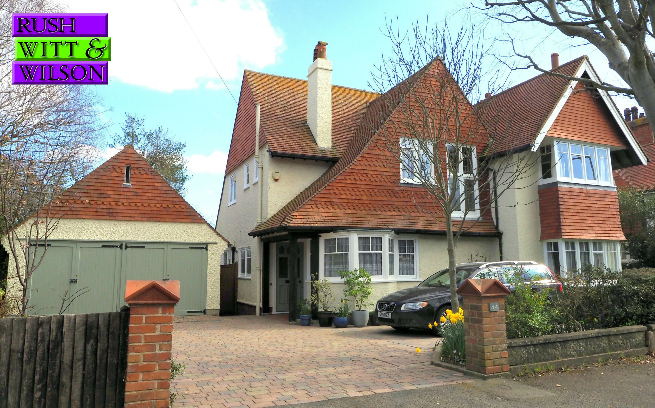
44 Sutherland Avenue, Bexhill-On-Sea, East Sussex TN39 3QL £765,000